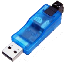
KNX USB Interface 332 Stick

Portable USB Interface Stick for KNX Bus